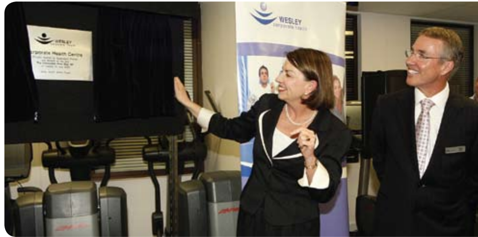
Queensland Premier the Hon. Anna Bligh officially opens the new centre

“We teach our clients how to reduce their risk of developing cancer, keep their weight in a healthy range and maintain their cardiovascular health.