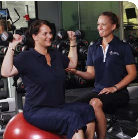
Top of the range LifeFitness equipment allows data logging of sessions

equipment and the exercise data can be stored on a USB, offering advanced data logging of sessions.