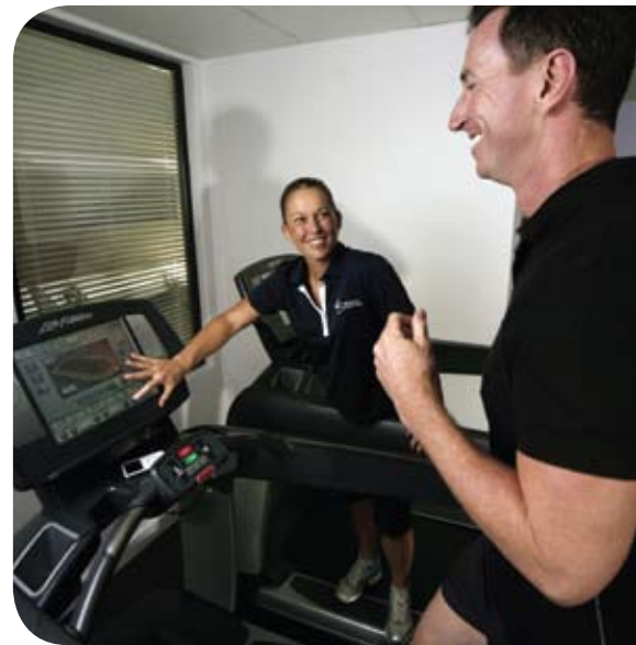
The Centre is supervised by a health professional at all times

Wesley Corporate Health is currently offering a free two week trial membership of the Wesley Wellness Centre. For more information call 3234 2600.